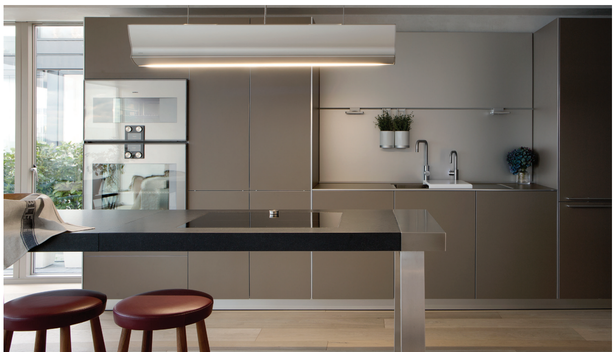
KITCHEN Bulthaup melamine resin doors, b3 natural aluminium wall panels conceal storage. Bulthaup b2 stainless steel and honed granite freestanding island. DINING Stools by Carl Hansen.