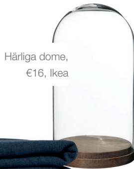
Härliga dome, €16, Ikea