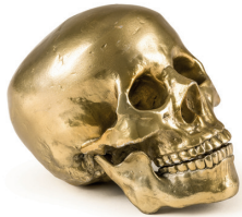
Wunderkammer skull, around €152, Diesel