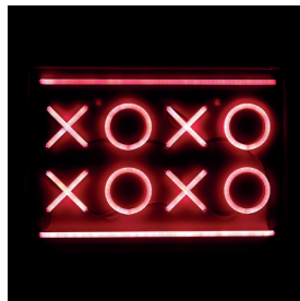
Neon wall light, €84, Urban Outfitters