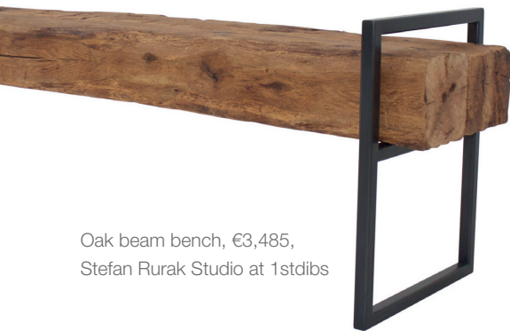
Oak beam bench, €3,485, Stefan Rurak Studio at 1stdibs